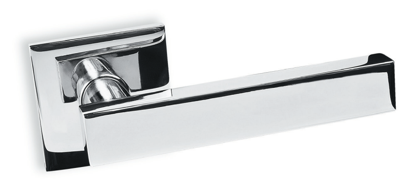
Finish - Shown in Polished Chrome | Available in all Henry Blake Hardware finishes

Product Code: SK1000 | Product Name: Pair Square Lever Handles