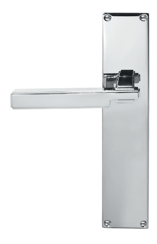
Finish - Shown in Polished Chrome | Available in all Henry Blake Hardware finishes

Product Code: SK1012 | Product Name: Art Deco Lever on Long Plate