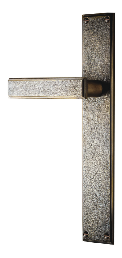
Finish - Shown in Dark Bronze | Available in all Henry Blake Hardware finishes

Product Code: SK1044 | Product Name: Textured Lever on Long Plate